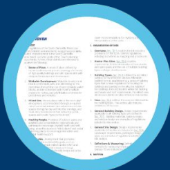
Draft Zoning District/Ordinance