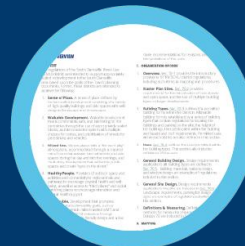
Revised Zoning District/Ordinance