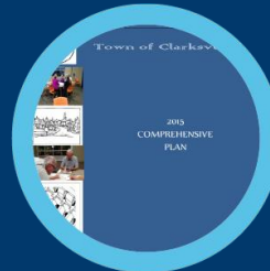
Revised Comprehensive Plan Amendment