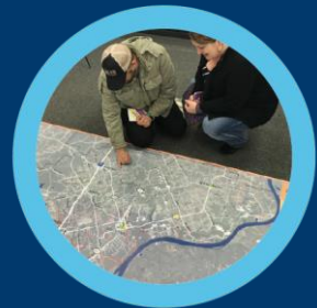
Public Meeting & Stakeholder Input