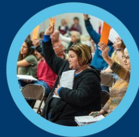
Public Hearing/ Adoption Process